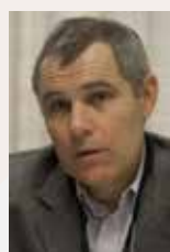
James Lorimer Shadow Minister of Mineral Resources, Democratic Alliance