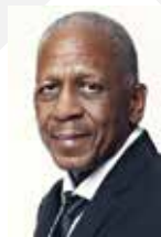
Dr Mathews Phosa